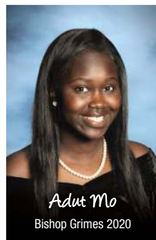
Adut Mo Bishop Grimes 2020