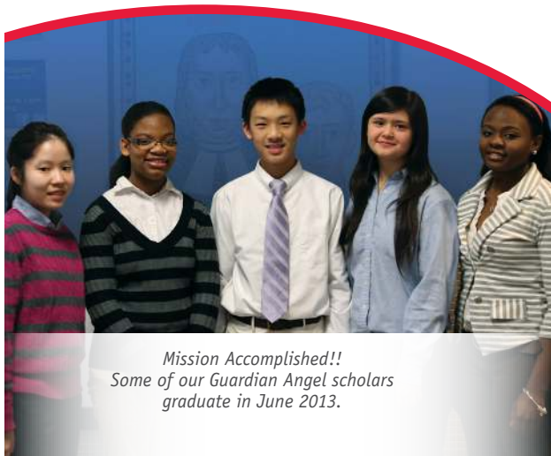
Mission Accomplished!! Some of our Guardian Angel scholars graduate in June 2013.